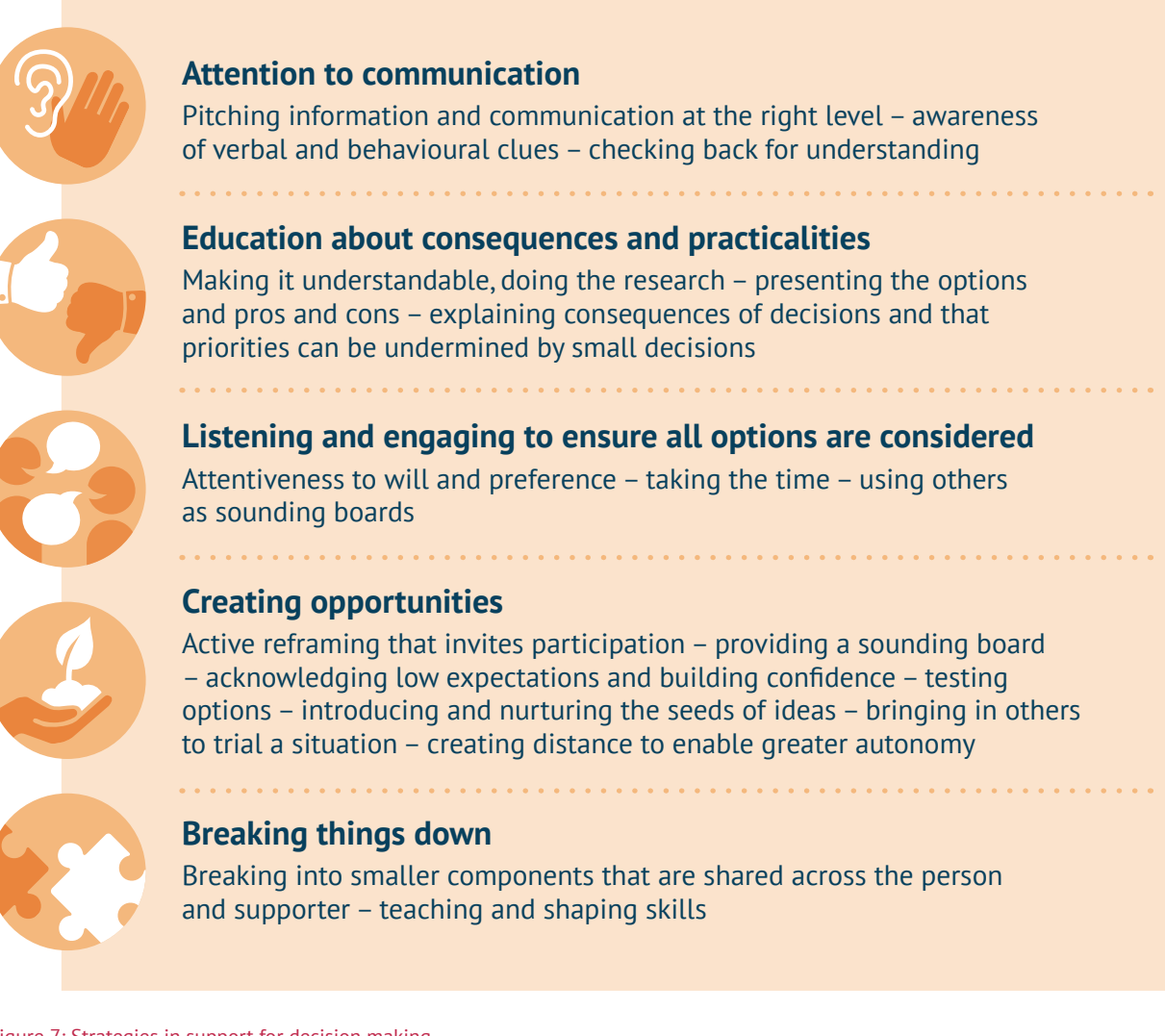
Figure 7: Strategies in support for decision making

Here, in Figure 7, we categorise and illustrate the range of strategies that have been identified from research.