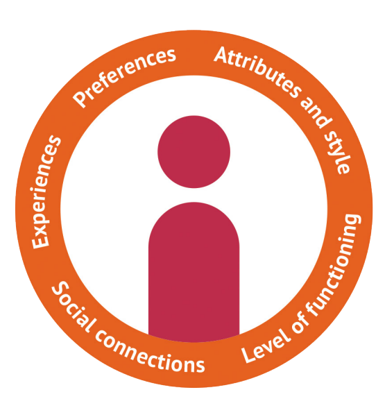
Figure 4. Knowing the person

Support for decision making is person centred. As Figure 4 illustrates supporters need to 'know' the person well. This means knowing all aspects of the person and having a sense of the person's self-identity or self- concept (Who I am and how I feel about myself) . This usually encompasses knowing about – their attributes and style – personal characteristics – likes, dislikes, preferences - skills, the effect on their understanding of their specific cognitive impairments – social connections - history and personal story. Part of knowing a person also means understanding the way they are seen by others in their network including the various 'experts' who have been involved in their life. Knowledge of what defines the person provides the conceptual context for understanding their will and preference.